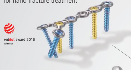
Linus for hand fracture treatment

We consider ourselves as a true partner – to be relied upon for routine tasks and special challenges alike.