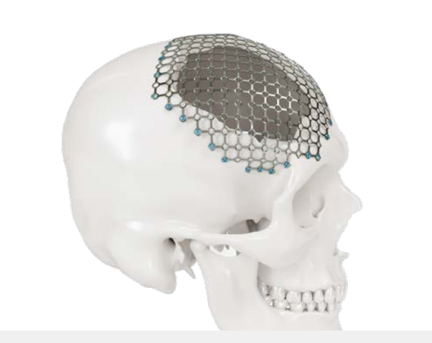
Cranial reconstruction with titanium mesh Restoration with patient-specific preformed titanium mesh

Restoration with laser-sintered titanium implant with osteo-conductive mesh structure