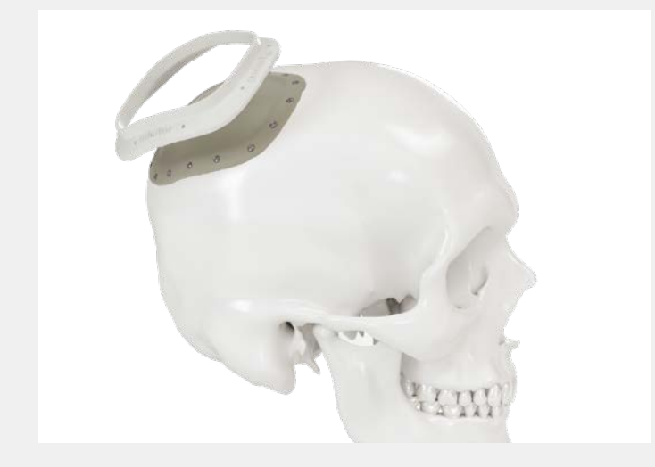
Cranial reconstruction with a solid PEEK implant Restoration with unperforated PEEK implant with marking guide for precise resection of the defect