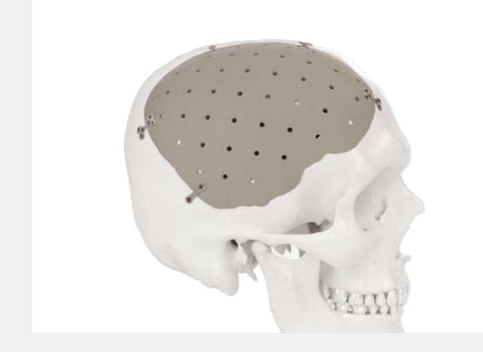
Cranial reconstruction with PEEK implant Restoration with perforated PEEK implant to enable connective tissue ingrowth