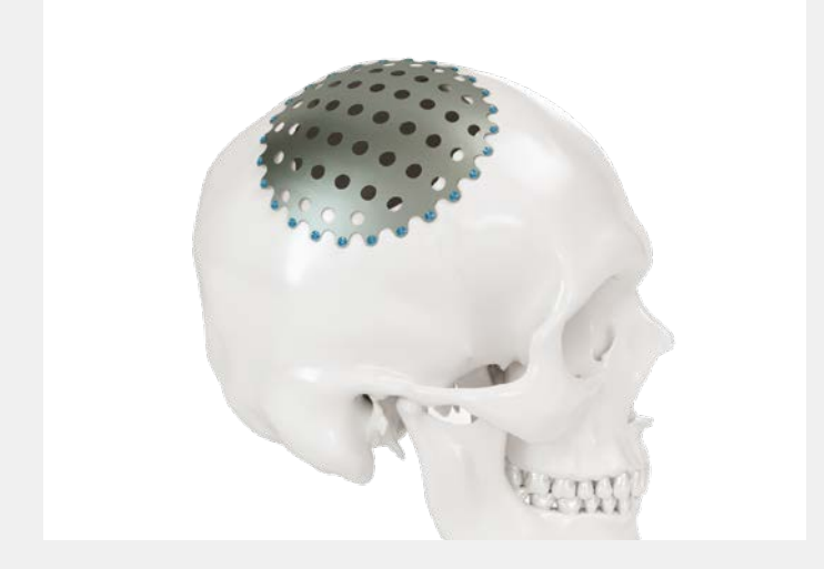
Cranial reconstruction with solid titanium Restoration with patient-specific preformed solid titanium