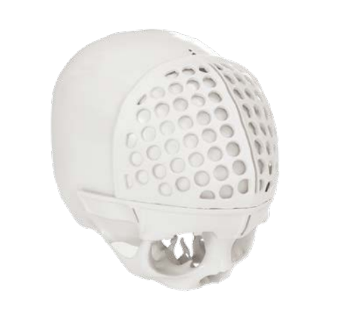
Correction of craniofacial malformations Restoration using additively manufactured marking guides made of polyamide