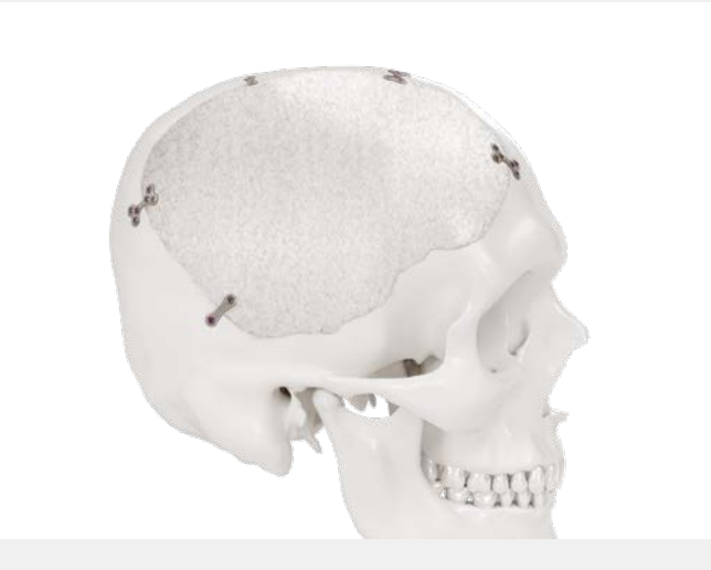
Cranial reconstruction with marPOR implant (UHMWPE) Restoration with porous polyethylene implant to enable osteointegration, vascularization and connective tissue ingrowth