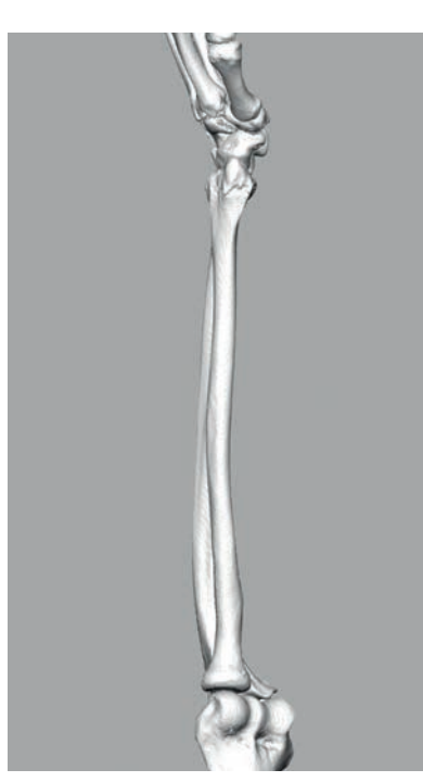
Scan unaffected forearm (left)

Planning results are only ever as up to date as the clinical data records! If the anatomical situation should change after scanning, the precision fit of the products can no longer be guaranteed.