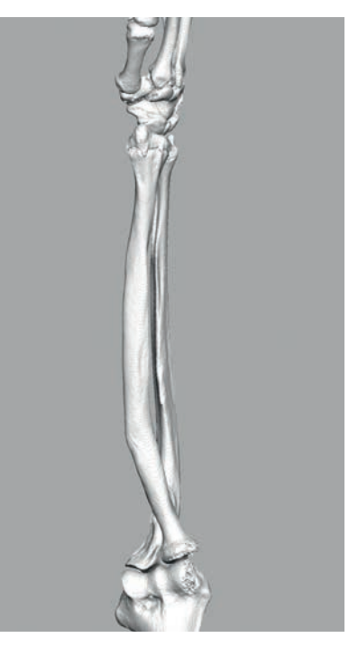
Scan affected forearm (right)