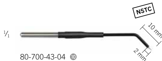
80-700-43-04 10 smartOne® tungsten-coated micro dissection needle, 45° angled