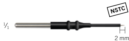
80-700-41-04 10 smartOne® tungsten-coated micro dissection needle