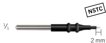
80-700-40-04 10 smartOne® tungsten-coated micro dissection needle