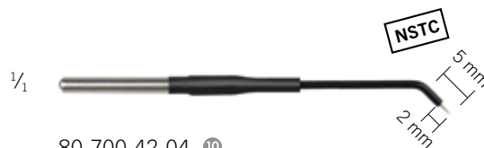
80-700-42-04 10 smartOne® tungsten-coated micro dissection needle, 45° angled