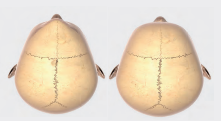
When comparing a child with (left) and without craniosynostosis (right), the difference in skull shapes becomes apparent.

If there is an early closure of the cranial sutures in newborns, this can lead to cranial deformities. The diagnosis craniosynostosis is not uncommon (about 1:2000 of newborns are affected). However, nowadays it can be detected and treated early.