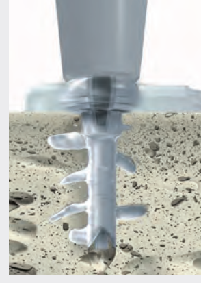
By activating the ultrasound, the resorbable SonicPin Rx® can penetrate into the cavities of the bone structure (left) and fuse with the resorbable plate to become a single unit (right).

The SonicWeld Rx® system has been on the market since 2005. The technique has been established and proven over the years. Its success in practice has been proven in several studies.