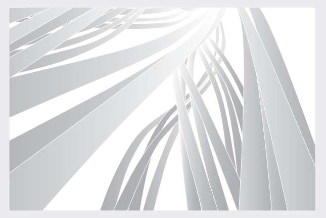
Before being implanted, the implant consists of polymers (long molecule chains).

In this patient brochure, you will find all the necessary information and instructions on SonicWeld Rx® and the resorbable implants of the KLS Martin Group.